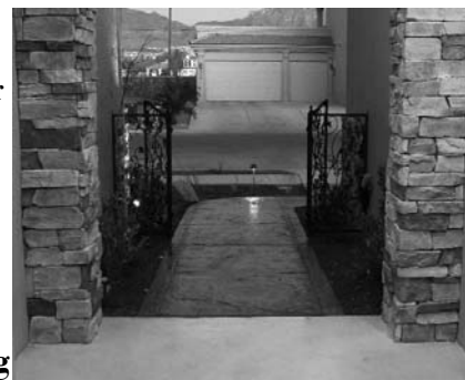
Zero-step threshold at entrance of certified home by Blue Ribbon Builders, El Paso, TX.

The program currently has 17 member builders located throughout the state of Texas and anticipates many more will want to join this exciting program, especially since so many of you are already building with minimum accessibility in mind. For more information on the benefits of being an EasyLiving Home™ Texas member builder, see page 3.