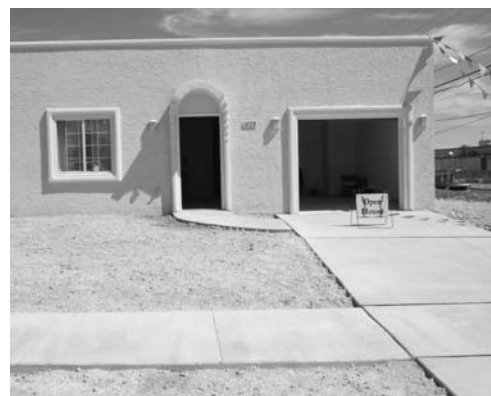
Accessible driveway and path of travel to accessible entrance in certified home built by Las Brisas Homes, El Paso, TX.