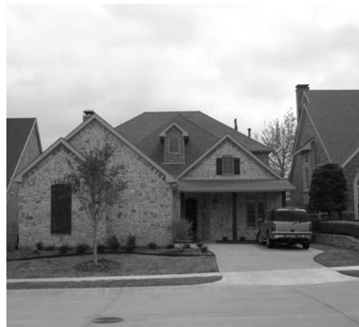
Certified home built by Tapestry Custom Homes, McKinney, TX.